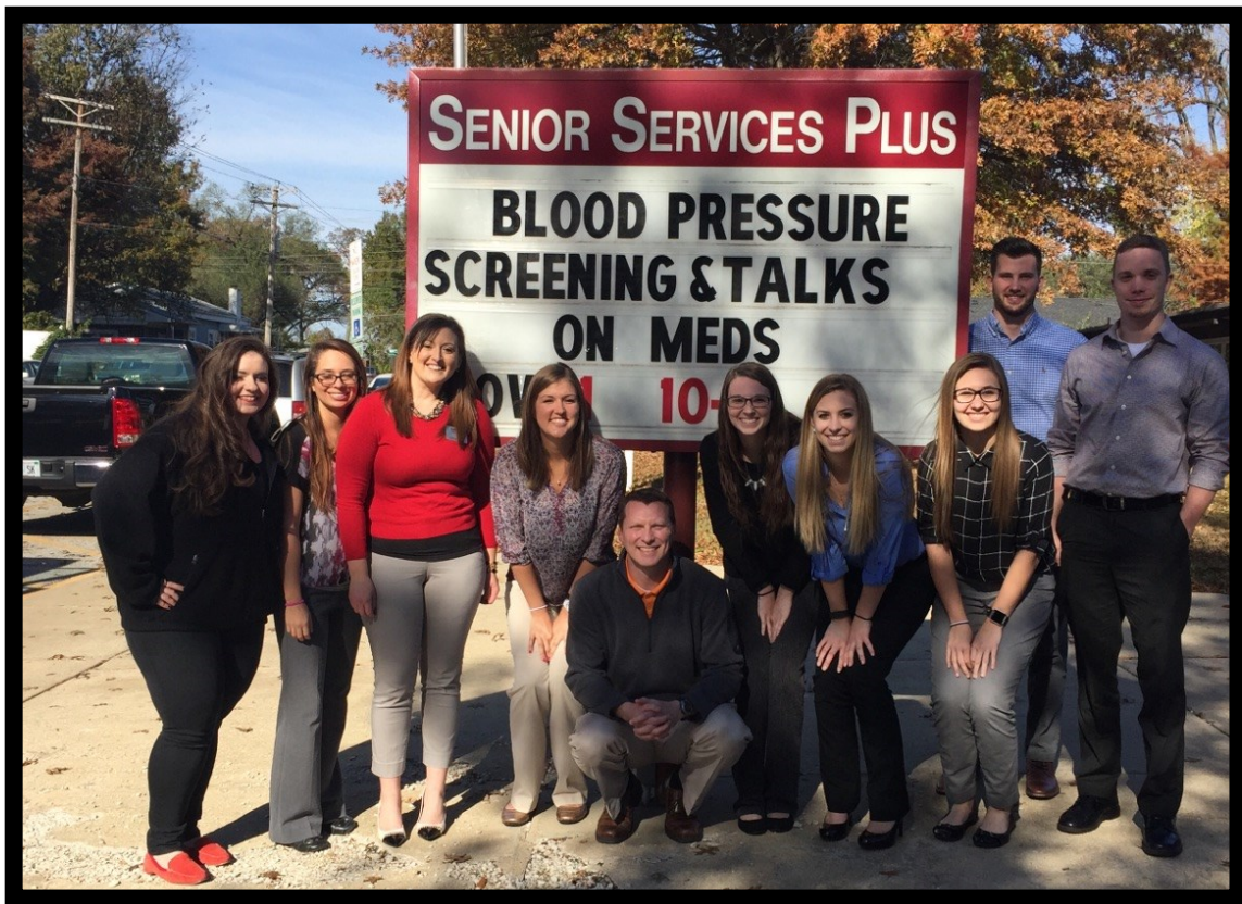
Blood Pressure Screening and “File of Life” Cards at SSP in Alton, IL