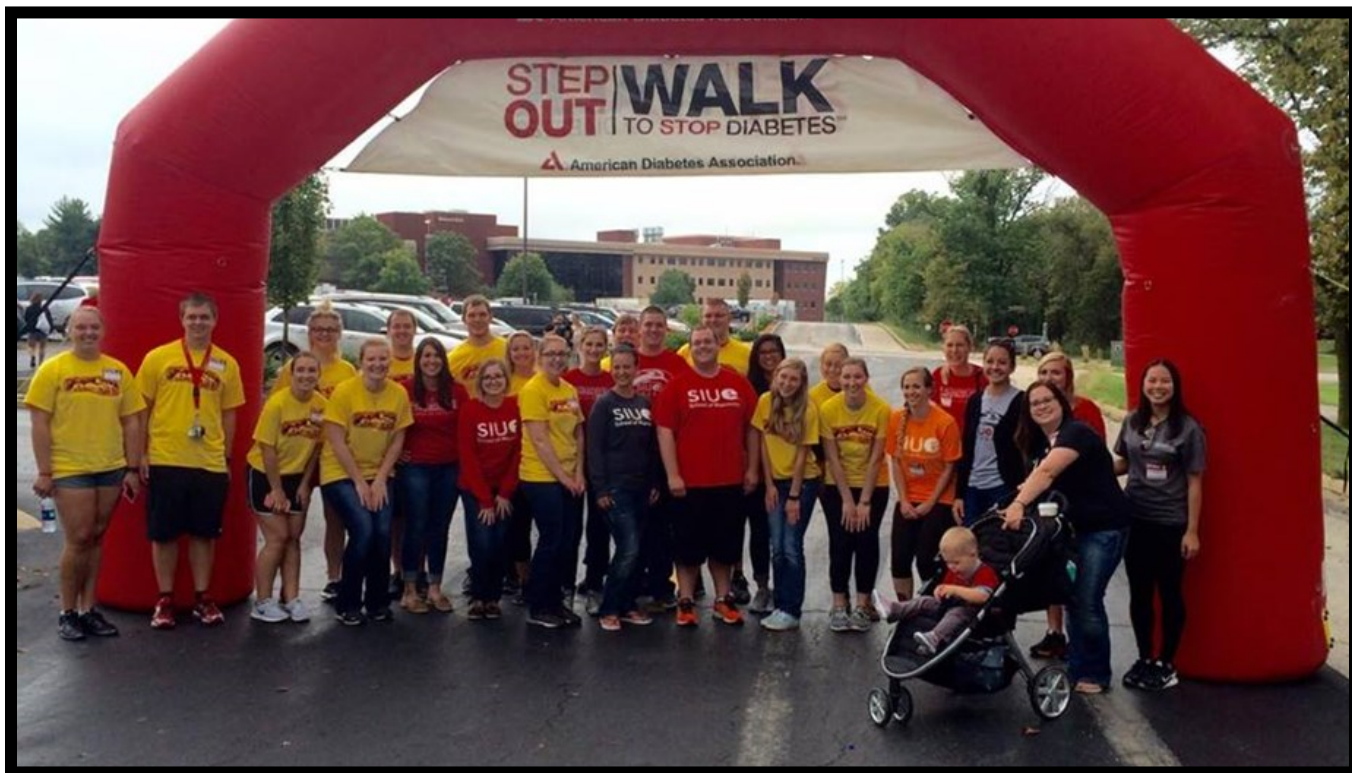
Student Volunteers and Participants at the Step Out: Walk to Stop Diabetes