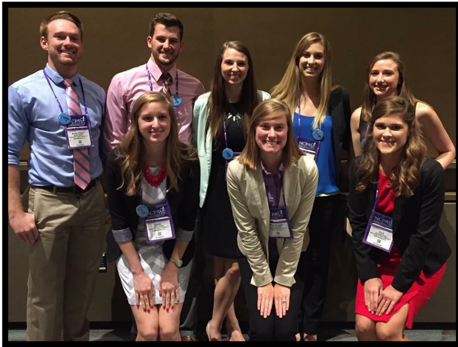
Students at the Annual NCPA Convention