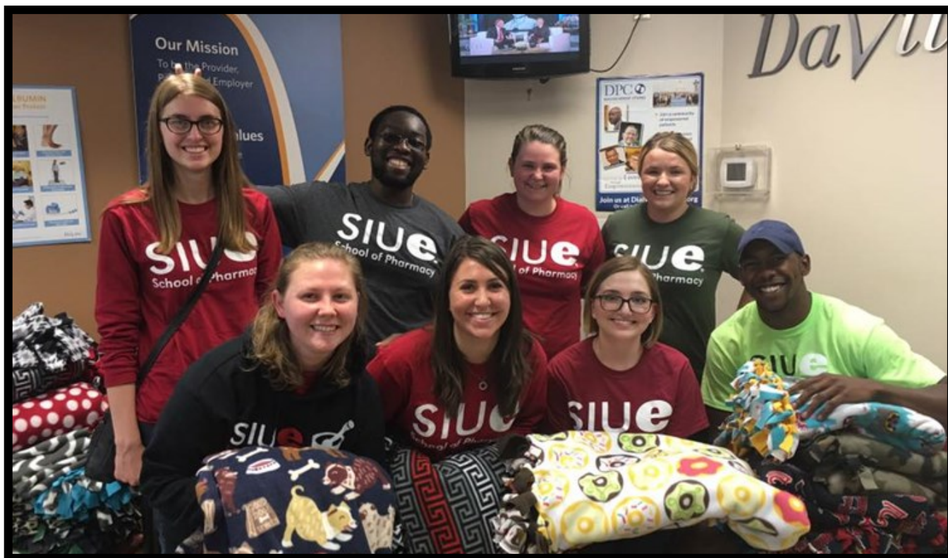
Dropping off blankets at the DaVita Dialysis Center in Edwardsville, IL